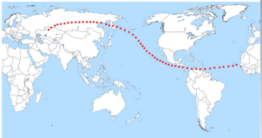
Original Projected Apophis 2036 Risk Path.

Within the United States, there was a major exercise held in the fall of 2008 to highlight some of the legal and policy issues. The workshop brought together 27 subject matter experts from across the US Government, including the military, State Department, NASA, national laboratories, national security, and homeland security. The scenario involved two impacting objects, a 270 meter "rubble pile" landing off the West African coast and a 50 meter metallic body impacting the National Capitol Region in the US. These two different elements were designed to pose as many challenges in deflection and mitigation to the players in as short a time as possible. The top recommendation following the exercise was that the NEO scenario was not captured in existing plans and that this needed to be corrected. All the participants strongly recommended that additional future exercises should be done and include more senior decision makers.